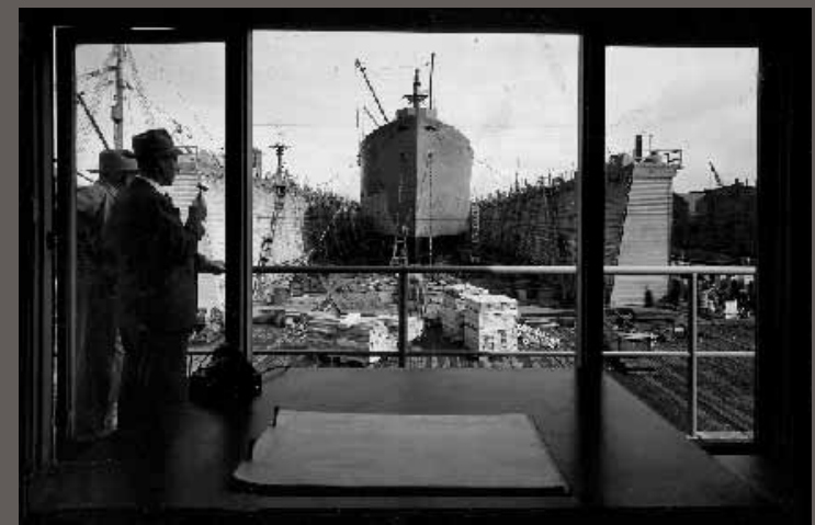
General Engineering & Drydock shipyard during World War II

Across the estuary is the Alameda Marina, occupying the site of the General Engineering & Drydock shipyard. Established in 1922, the yard built diesel-powered ferryboats. During World War II, it was expanded and equipped with a floating drydock (shown above), making it one of the largest ship-repair facilities on the coast. It closed in 1948. Alameda Marina, which opened in 1967, has retained a number of the old shipyard buildings for new uses.