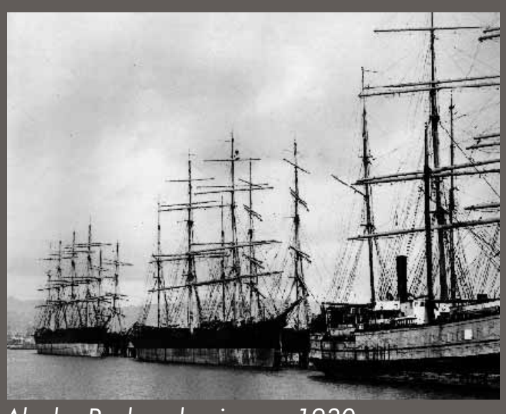
Alaska Packers basin, ca. 1930

Across the estuary is the Alameda Marina, occupying the site of the General Engineering & Drydock shipyard. Established in 1922, the yard built diesel-powered ferryboats. During World War II, it was expanded and equipped with a floating drydock (shown above), making it one of the largest ship-repair facilities on the coast. It closed in 1948. Alameda Marina, which opened in 1967, has retained a number of the old shipyard buildings for new uses.